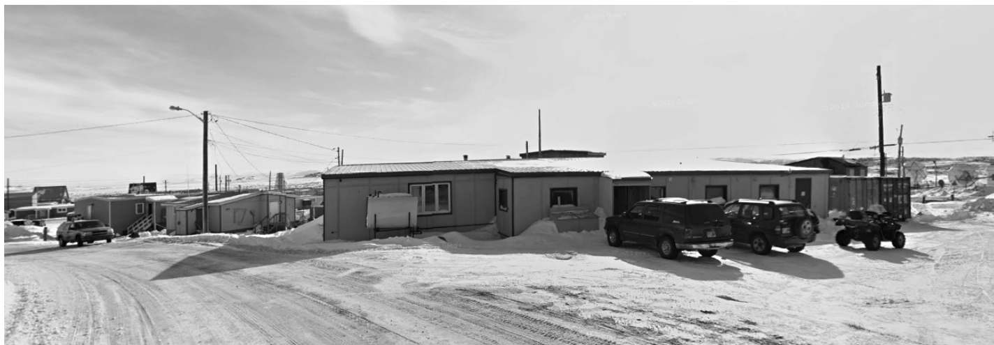
Building 778 on Fred Coman Street

On the South West side of the City's Core Area, the Uquutaq Society has submitted a development application DP 20-062 to increase the existing capacity of Building 778 from 20 to 42 beds and execute interior renovations. This Low Barrier Shelter will provide an overnight respite program without the standard zero-tolerance policy for intoxication, operating with three (3) staff members, serving both vulnerable men and women. This change will reduce existing barriers for individuals to access services.