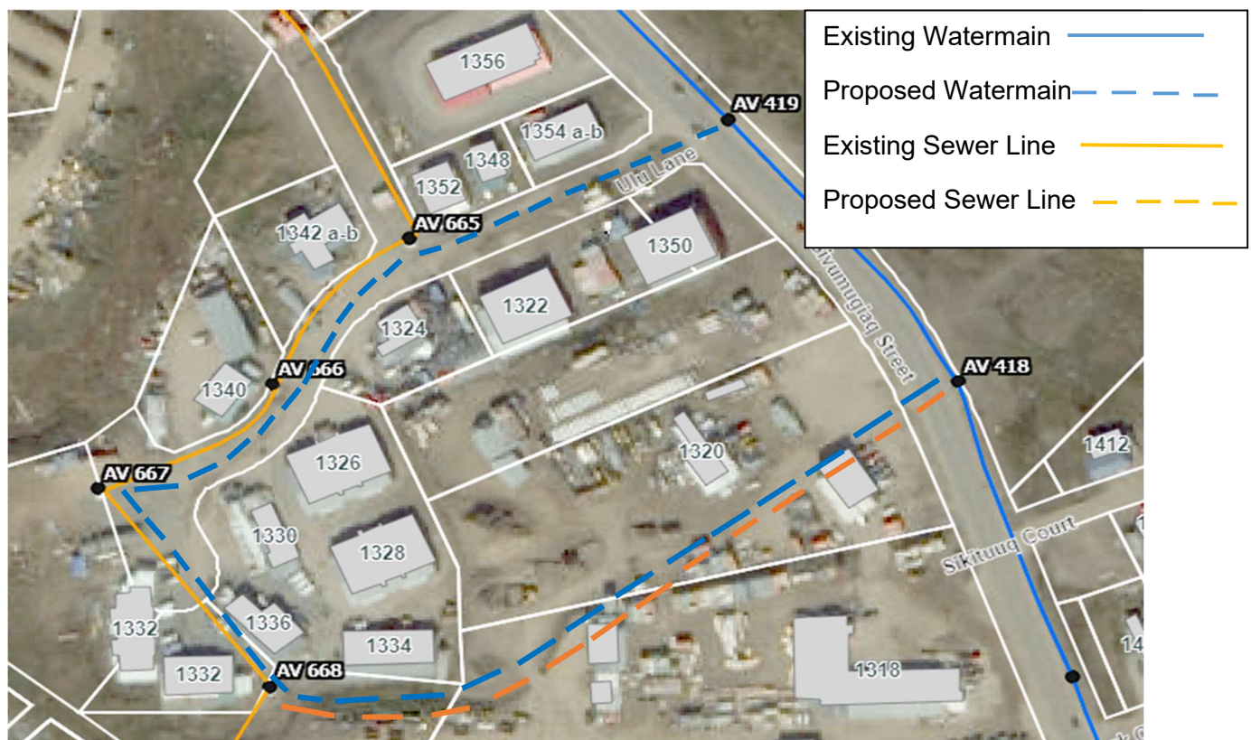
Figure 1: Ulu Lane & BBS Development Servicing Option Analysis

The project Base Solution will include extending water service along Ulu Lane from the existing AV 419 on Federal Road to AV 668 just beyond the Ulu Lane cul-de-sac. This routing includes placing the new watermain above the existing sanitary sewer system and utilization of existing AV's. In addition, provide new water and sanitary services to accommodate the proposed BBS Land development. The re-development plans for the BBS lots has not been fully confirmed and will be subject to City approvals, re-zoning, City approval and other external factors. The BBS extension would include extending services from AV 688 through the newly proposed development to the existing AV 418 on Federal Road. Service line designs will be required for all existing and future building lots. The Base Solution is depicted in Figure 1 below.